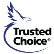
EXHIBIT SPACE CONTRACT